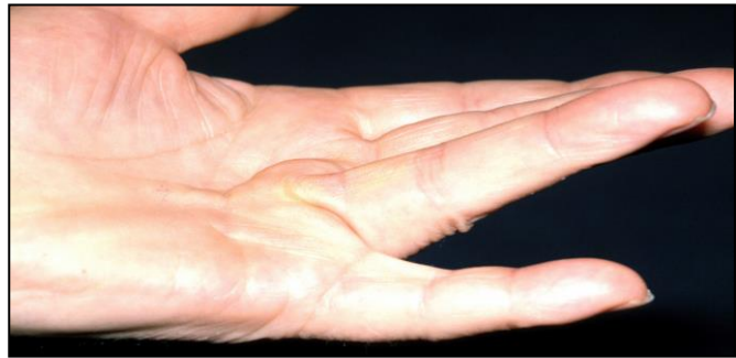
b) Contracture of ring finger