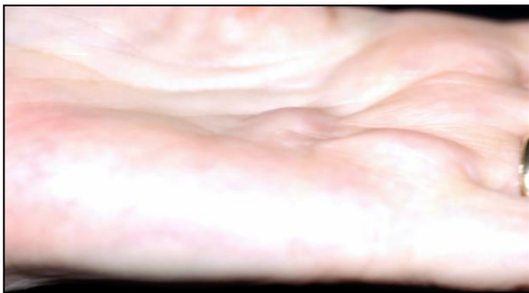
Fig 1a) New palmer nodule